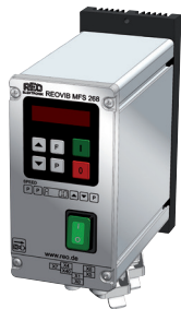
REOVIB MFS 268 IP54 (with heat sink 6 A)