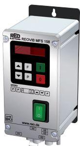
REOVIB MFS 158 IP54