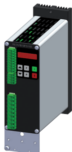
REOVIB MFS 168 IP20