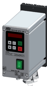
REOVIB MFS 168 IP54