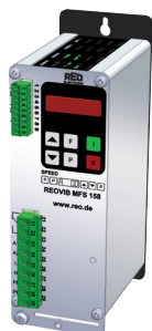
REOVIB MFS 158 IP20